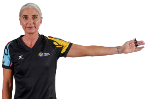
CENTRE PASS DIRECTION HAND SIGNAL